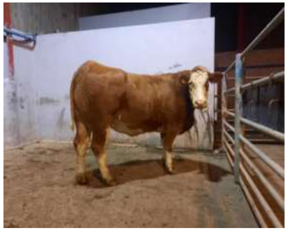
RW Sim 03/19 @ £2,000.00