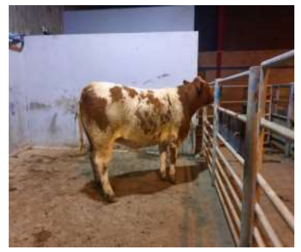
RW Sim 03/19 @ £2,800.00