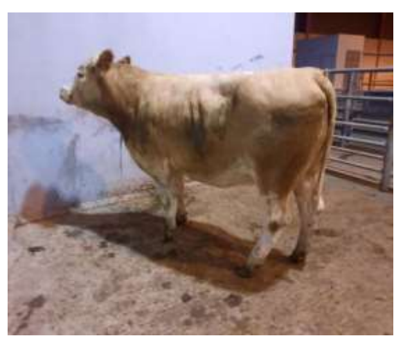
DW Sim 04/19 @ £2,650.00