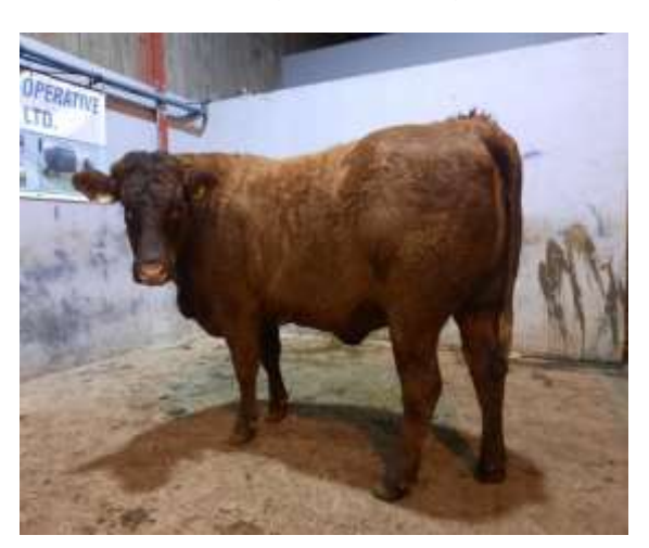
R Sal 04/19 @ £1,800.00