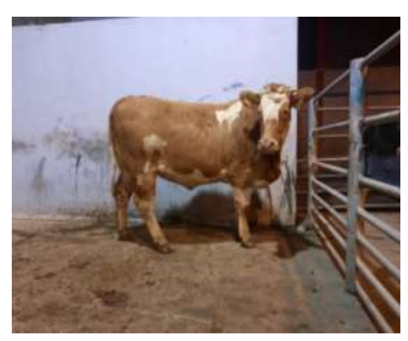
DW Sim 04/19 @ £2,500.00